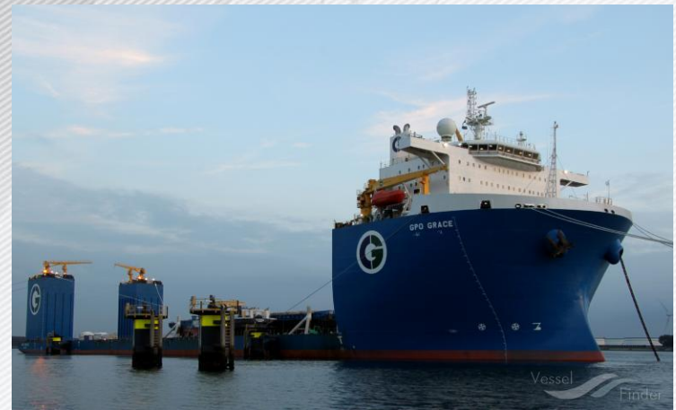
Special Cargo Carrier