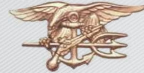
U.S. Navy SEAL's

These are the most highly skilled and qualified Maritime Security Operators in the World.